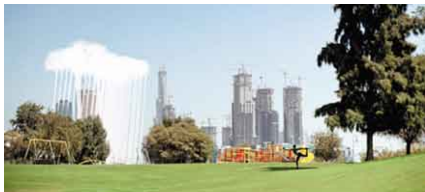
SKY'S THE LIMIT – An artist's impression of the Cloud Hotel in Dubai that will be built over the next few years